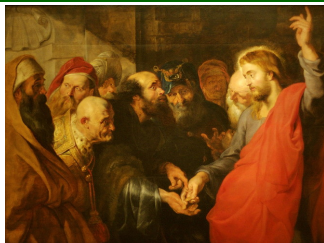
The Tribute Money." Peter Rubens, 1512